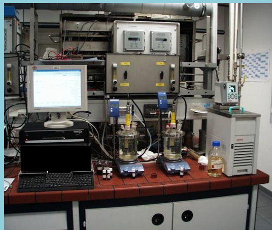
Electrochemical corrosion test

Kurita's patented ACF technology is a proven control program to prevent ammonium salt fouling and corrosion. Products are based on a very strong organic base that directly reacts with the corrosive species and converts them into non-corrosive and non-depositing liquid ACF components.