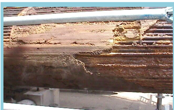
Fouled and corroded heat exchanger bundle

But often the installation of a water-wash is not possible or will provide negative impacts on the process or products. Limitative factors are the allowable water concentration in hydrocarbons or the very high construction costs for a suitable washing system.